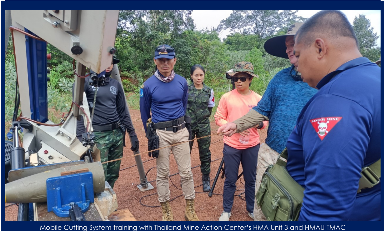
Mobile Cutting System training with Thailand Mine Action Center's HMA Unit 3 and HMAU TMAC

August was another interesting month, featuring a trip to Reston, Virginia for the HDR&D Requirements Workshop. Most of the month seemed to revolve around working on proposals for funding projects discussed during an informal meeting with HDR&D at the end of July in Honolulu. We pitched a number of different concepts, but in the end most of them failed to meet the fairly narrowly focused range of interests at HDR&D.