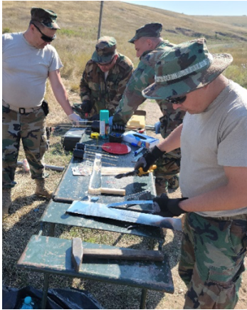
Modovian Army IMAS L3 mentees

The last day was reserved for our internal discussions and a meeting with HDR&D. This meeting limited the scope of our proposals and provided a deadline of 15 September to get them submitted.