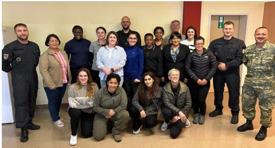
1st UN Safer Guard Training for Women Ammunition Technical Experts, with members of the UN Office of Disarmament Affairs (UNODA) and the Austrian Ministry of Defense.

Golden West remains committed to supporting the advocacy, training and practice of females in the world of ammunition management enhancing the safety and security of stockpiles to the civilian population and enhancing domestic and regional security as a confidence building measure.